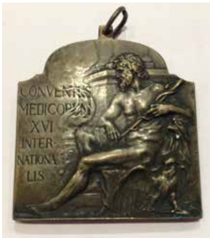
Figure 1: Aesculapius, as depicted on the medal of the 16th International Medical Congress, held in Budapest, 1909.

Aesculapius is a name closely associated with medicine in Greece. It is unclear if a man with that name, who practised healing, ever walked the earth. His name is linked with a 'school' of medicine and religious healing. His symbol, a snake wound around a staff, remains one of the emblems of modern medicine today (Figure 1).