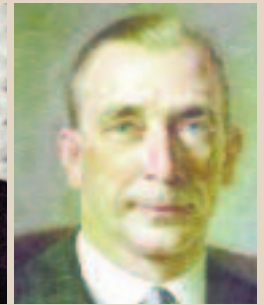
Figure 3: Sir Terence Millin.