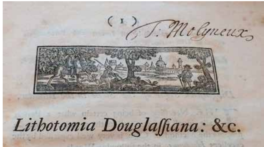
Figure 1: Signature of Sir Thomas Molyneux in his copy of Lithotomia Douglassiana , 1723.