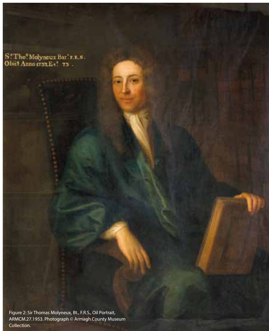
Figure 2: Sir Thomas Molyneux, Bt., F.R.S., Oil Portrait, ARMC.M.27.1953.