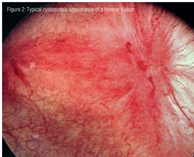
Figure 2: Typical cystoscopic appearance of a Hunner's ulcer.

Sadly I do not have the space to tell you the variety of treatments attempted for this condition over the years. Suffice it to say they are more numerous than its many names and