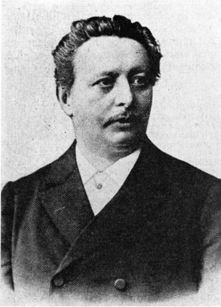
Fig 3 Max Nitze (1848–1906) – the inventor of the cystoscope with the terminal lamp and the telescopic optics.

by using a tube with a distal window and an ingenious form of obturator, was able to catheterize both ureters in the female. This instrument has not yet been found.